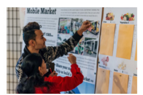
Students collect information from community partners through the Participatory Budgeting Method.