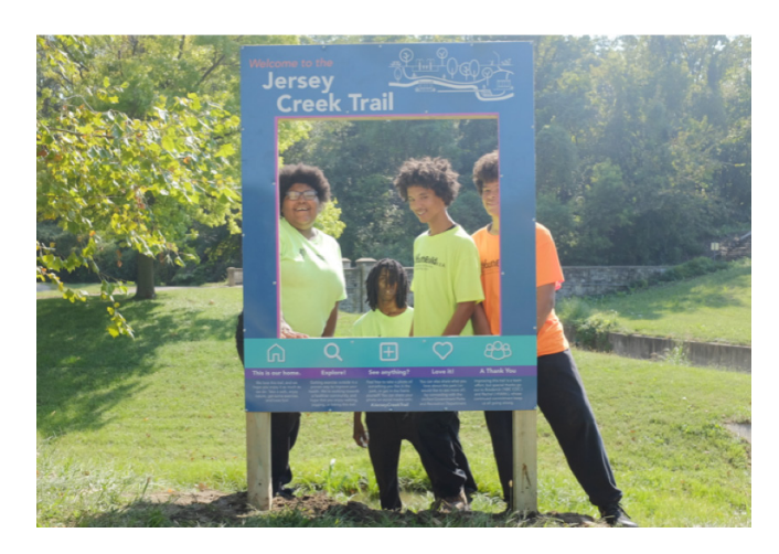
YouthBuild highschool students collaborate with the installation of park elements that are intended to promote new conversations about the park and its potential new uses.

As architects move towards a more adaptive design paradigm that concerns itself with issues of social impact, there are limitations to appropriate processes and frameworks to move through on the path towards a substantial resolution of the design challenge. The basic progression of schematic design, design development, construction documents, and contract administration is not formatted properly to deal with more ambiguous design challenges such as establishing community-centered coalitions, advocating for social equity, and responding to the needs of the community. For this reason, many architects that engage in social impact design as professionals or as part of a firm are often limited in their ability to be effective advocates. Rather than meeting communities where they are, architects often attempt to frame their relationship in limited ways, budgeting their time with communities in need of social impact design services as they would with a client. The evolution of an architect's role and responsibility is nonetheless limited by a paradigm that is client-centered, and therefore unable to adapt to design challenges where the community is the client, and the design services rendered are for the public good.